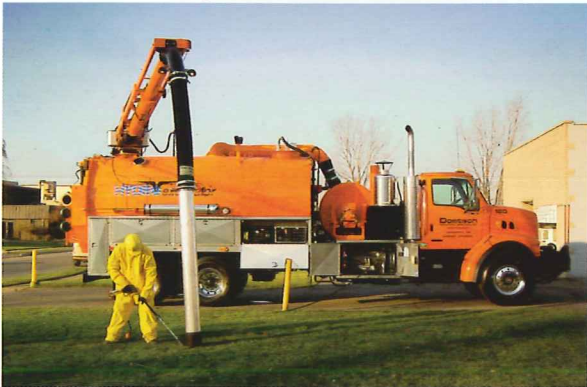
The safest digging alternative since the shovel. SM