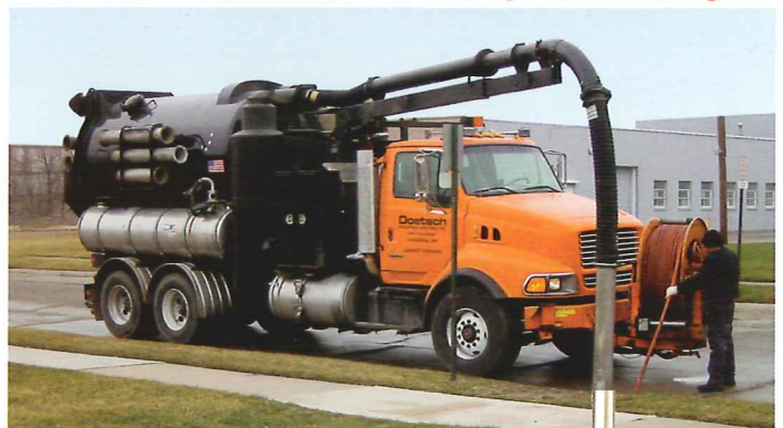
Vacuum power with precise jet-rodding action to remove solid and liquid debris from your entire waste water collection system or treatment facility.