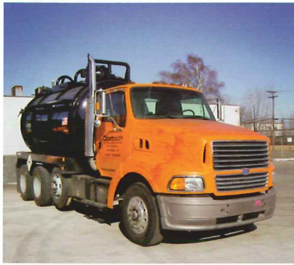
3500 Gallon liquid vacuum tanker.