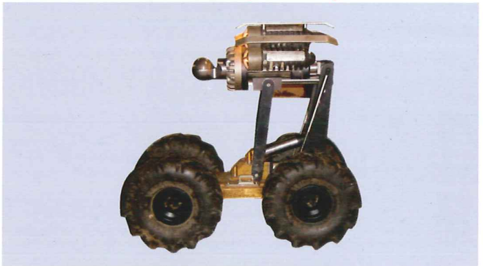
Inspect and advise on pipeline systems of virtually any diameter. Residential and industrial process lines.