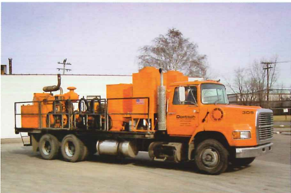
Thirteen thousand PSI hot water blasting equipment with two, one million BTU boilers capable of more than forty gallons per minute.