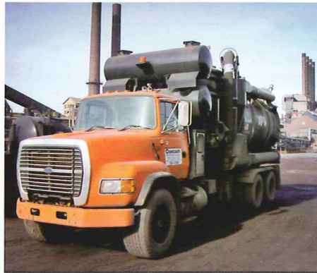
Industrial vacuum loader with up to 28 inch vacuum systems for wet or dry materials.